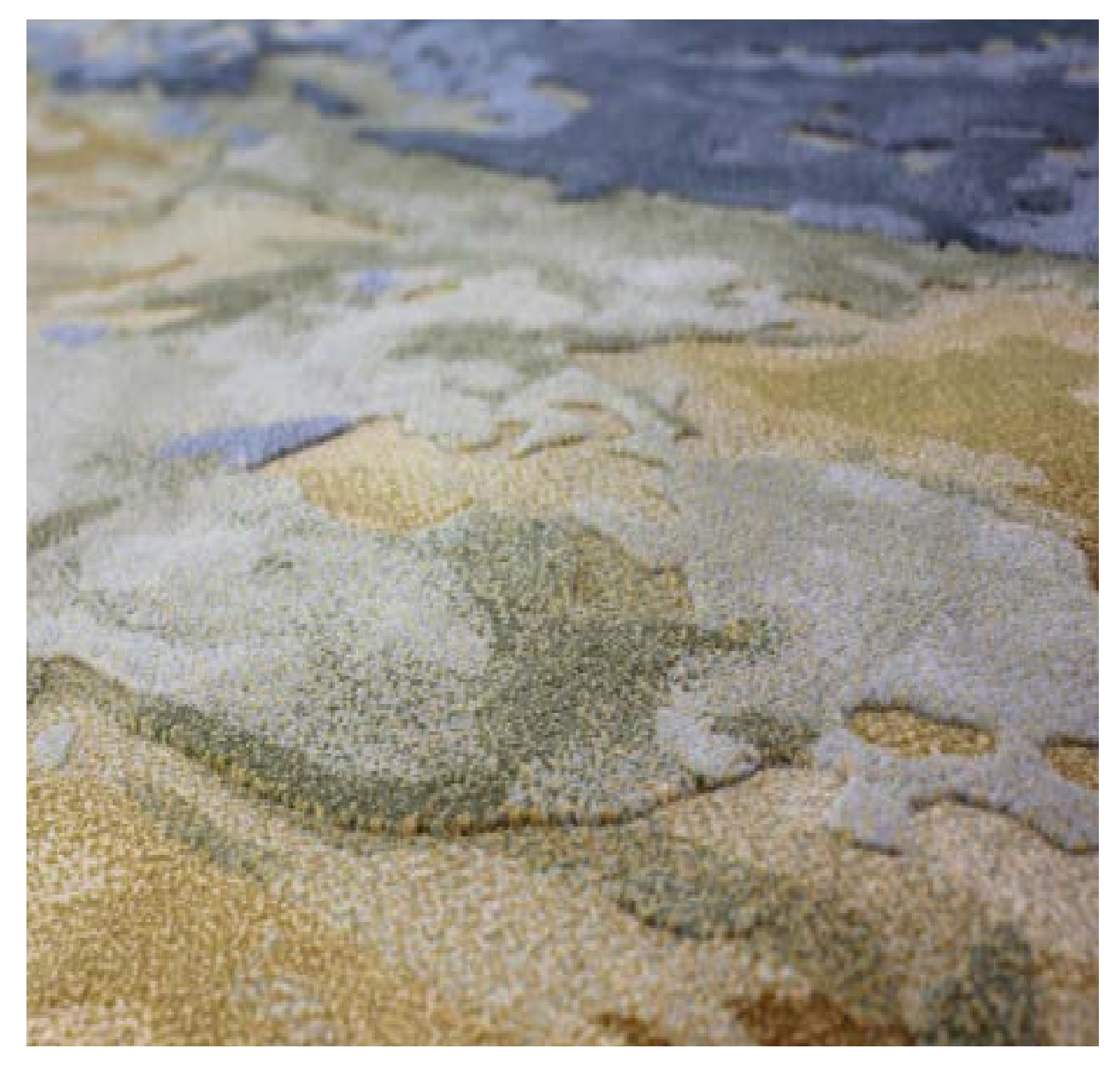
EUCALYPT - Oil