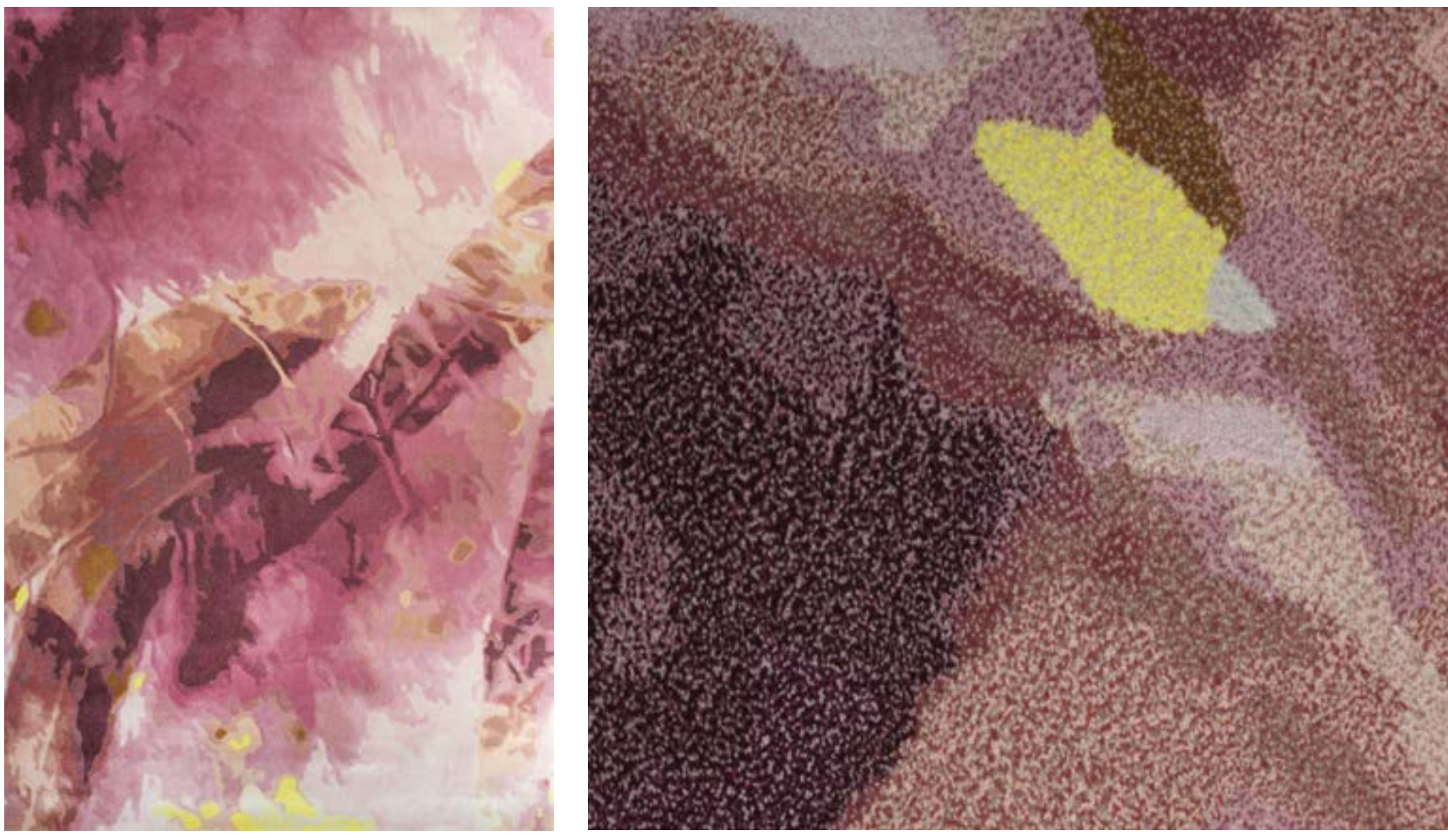
Summer Harvest - Berry