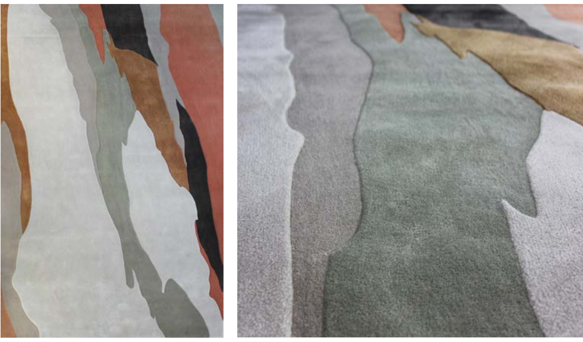
Coolabah - Koala