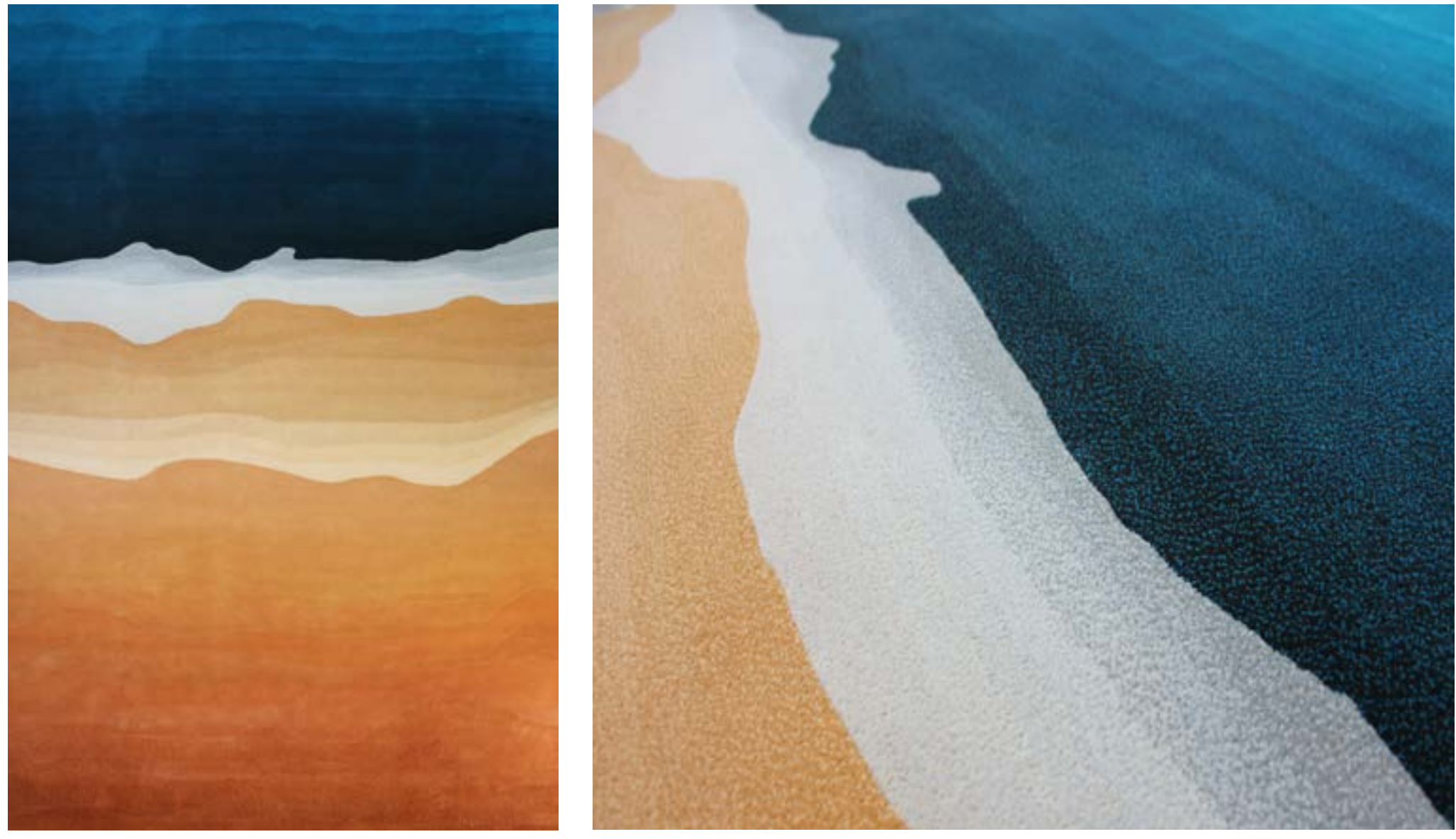
Coast - Coral