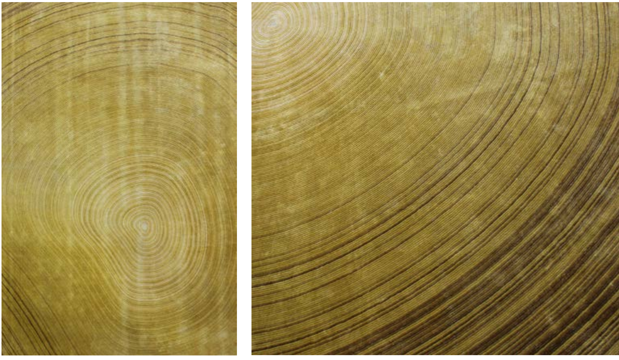
Pinnacle - Gold