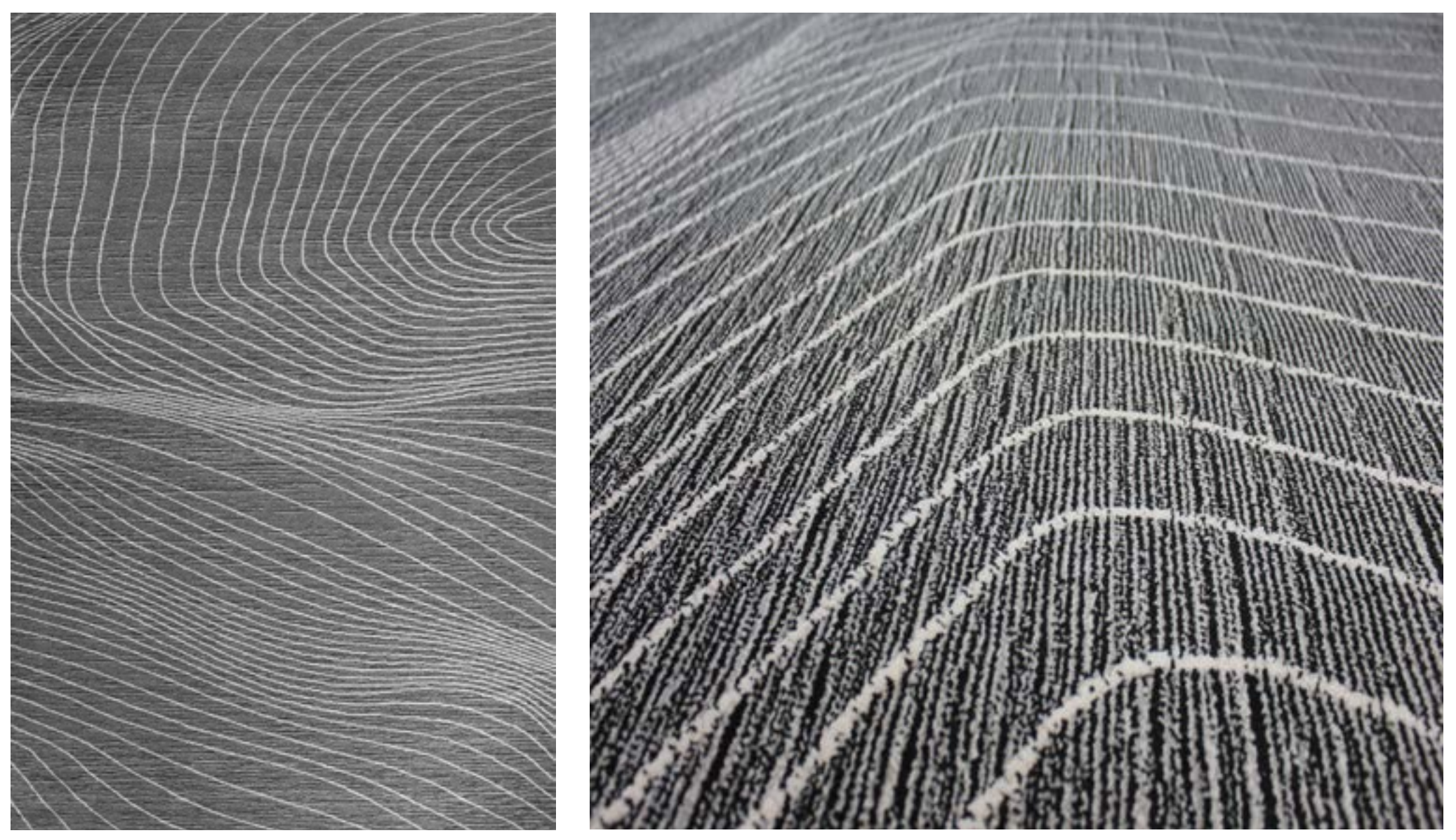
Summit - Black