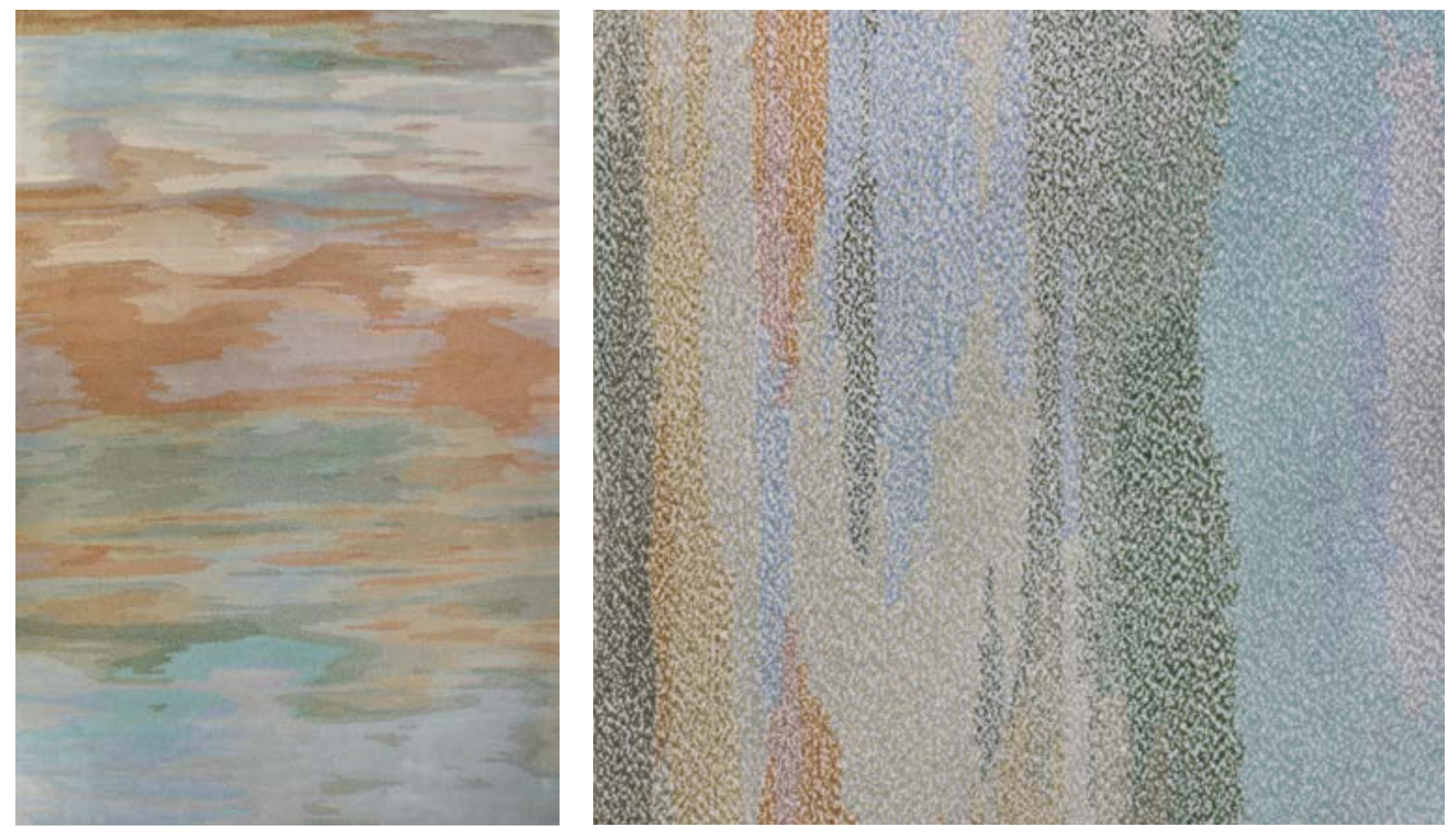
Gum - Pastel